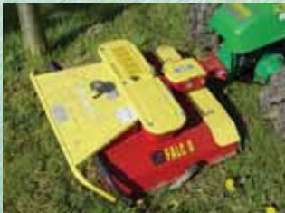
FALK Rough Cut Mower