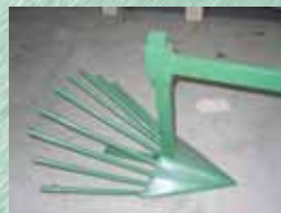
AP Potato Lifter: