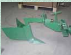
AS1 Adjustable ridger/furrower.